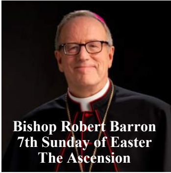
Bishop Robert Barron 7th Sunday of Easter The Ascension

Peace be with you. Friends, we come together today on the 7th Sunday of Easter to the wonderful feast of the Ascension of the Lord, a very important feast and one that has all sorts of interesting theological and spiritual implications.