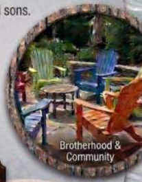
Brotherhood & Community

COME READY Be honest. Be challenged. Be still. GOD IS SPEAKING. MAKE TIME TO HEAR HIM.