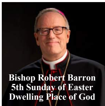
Bishop Robert Barron 5th Sunday of Easter Dwelling Place of God

Peace be with you, friends. On this fifth Sunday of Easter, we have these marvelous readings that are linked in a really interesting way, but I think you've got to be attentive to a somewhat hidden theme that runs like a golden thread through them, and the theme is the Temple. The Temple in Jerusalem was the focal point of Jewish life.