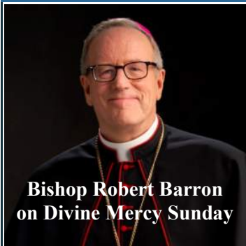
Bishop Robert Barron on Divine Mercy Sunday

Peace be with you, friends. For this third Sunday of Easter, we read once again the story of the two disciples on the road to Emmaus. You know this story, it's such a masterpiece. It's about something that happened long ago, yes, but it's also about the church now.