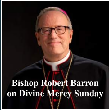
Bishop Robert Barron on Divine Mercy Sunday

Peace be with you, friends. We are continuing our celebration of the Easter season on this second Sunday of Easter, Divine Mercy Sunday. St. Thomas Aquinas says mercy is compassion in regard to someone else's suffering.