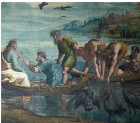
The Miraculous Draught of Fishes by Raphael

God tells his prophet that he needs someone to spread his Good News, asking, “Whom shall I send?” Isaiah replies, “Send me.” Being “touched” by the Lord causes a conversion in Isaiah that leads him to a strong desire to share the Good News.