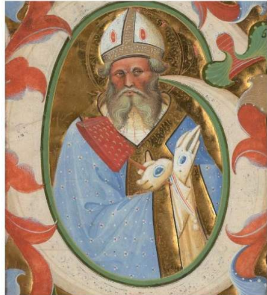
Artful C. Saint Blaise, Master of the Murano Gradual, Illuminator, J Paul Getty Museum

He is the patron saint of throat illnesses, animals, wool combers, and wool trading.