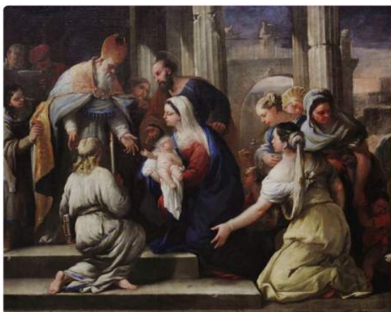
Presentation at the Temple by Luca Giordano

We often face rough patches on our journey of faith. At those times, we can gain strength from our mountaintop experiences. Like Our Lady, we can keep pushing toward fulfilling our faith obligations and put our spirituality to work. For nourishment, we receive the gift of the Real Presence of Christ in the Eucharist at each Mass. Let's receive him with joy, as Simeon did, so that when it's difficult to fulfill our obligations, we can draw strength directly from Our Lord.