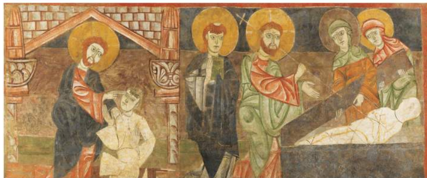
Fresco of The Healing of the Blind Man and the Raising of Lazarus, made in Castile-León, Spain

Jesus' mission is about setting the oppressed free. We are called to join him. As we participate, we need to rely on God's grace and be aware that we are empowered as God's sons and daughters.