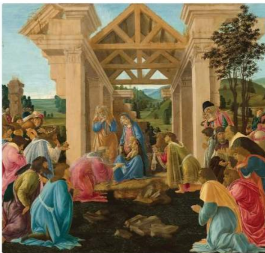
The Adoration of the Magi by Sandro Botticelli

The papal visit got me thinking about how God reveals himself and how a modern-day epiphany can take place. The pope’s role is one of showing us Jesus. In the United States, he showed God’s love in front of the press. What does he do? He gets out of the car, goes to a young boy in a wheelchair, and kisses him. People from all over the world came to hear what the pope had to say and to see what he would do. I would suggest to you that an epiphany took place. Eyes were opened as people saw the mercy of God and the love of God in the simple, powerful actions of the Holy Father.