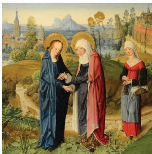
The visitation scene from the life stories of Mary

These biblical stories from the Old and New Testaments reveal powerfully that Advent is about us, the adopted sons and daughters of God, receiving the Word at Christmas. Jesus, the mighty one, blesses us. Merry Christmas!