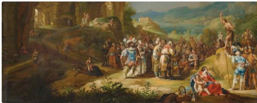
The Preaching of John the Baptist by Bartholomeus Breenbergh

When I feel like I am in the wilderness, I need to turn my life around by listening to John's message of the baptism of repentance, metanoia . That word means turning from what hurts you back to the right way. God is calling us to do just that this Advent. He wants us to examine our hearts, the way we are living our lives. If we are doing things that are contrary to the Lord, then God is asking us to turn away from what is hurting us or turn from the wrong way back to the right path. That's repentance. It is a change of heart that all of us need to make.