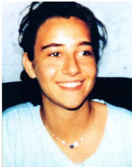
OFFICIAL PHOTO FOR THE BEATIFICATION CAUSE OF ITALIAN CHIARA BADANO.