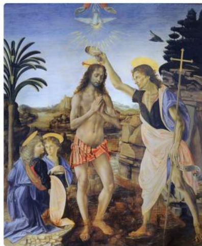
The Baptism of Christ by Andrea del Verrocchio and Leonardo da Vinci, c.1475

As the Father sent Jesus, so he sends you. Embrace your baptismal call, lean into the Spirit’s power, and go forth as an agent of divine mercy.