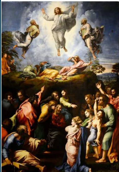
The Transfiguration by Raphael

Isn't it exciting how our readings this Sunday talk about change and transformation? If you're like me, you're always looking for positive change in your life. Let's start with Abraham's story in Genesis 15. God made three promises to Abraham, but Abraham struggled to see how these would manifest in his life. Have you ever felt that way about God's promises?