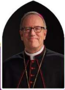
BISHOP ROBERT BARRON