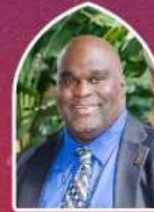
DEACON HAROLD BURKE-SIVERS