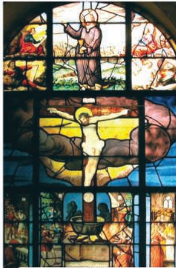
Window of the Church of St. Etienne representing the miracle des Billetes

During Easter of 1290 a non-believer who harbored animosity toward the Faith and who did not believe in the Real Presence of Christ in the Eucharist was able to gain possession of a consecrated Host with the intent to desecrate the Holy Eucharist. He stabbed the Host and threw the Blessed Sacrament into boiling water. The Host miraculously came out of the water right in front of the man, who was distressed by this. And so he put the Host in the basin of a pious woman. The woman immediately brought the Host to her pastor.