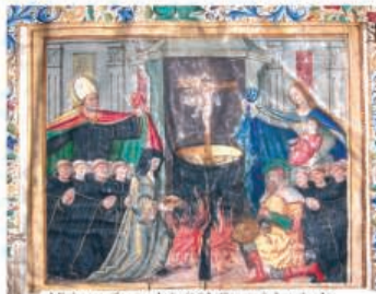
Miniature of a cartulary (16th Century), kept in the National Archives which represents the scene of the sacrilege