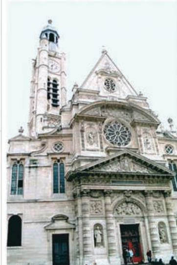
The Church of St. Etienne du Mont