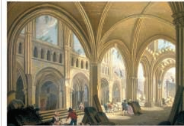
Demolition of the Church of Saint-Jean-en-Grève, Pierre-Antoine Demachy (1797)