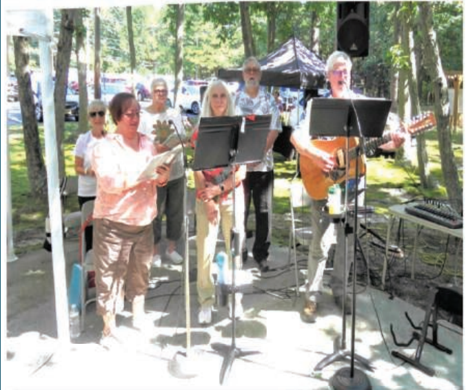
OUR CHOIR AT THE PARISH FESTIVAL MASS AUGUST 27

The next program will be held October 6 - 8, 2023 at the Family Life Center in Malvern, PA. For more information, or to register, visit www.HelpOurMarriage.org or call 215-766-3944 or 800-470-2230. All inquiries are strictly confidential.