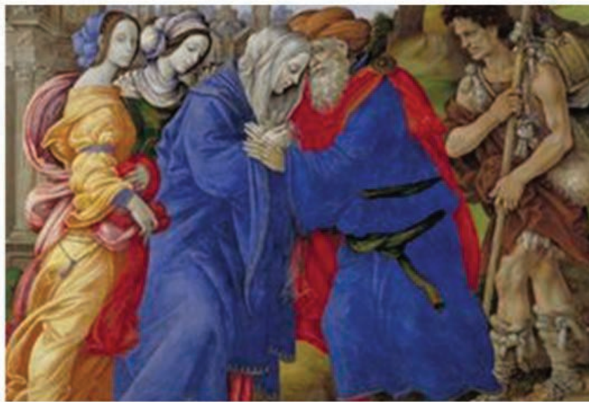
Lippi, Filippino: The Meeting of Joachim and Anne Outside the Golden Gate of Jerusalem

The theme for the 2023 celebration selected by the pope is "His mercy is from age to age" (Lk 1:50).