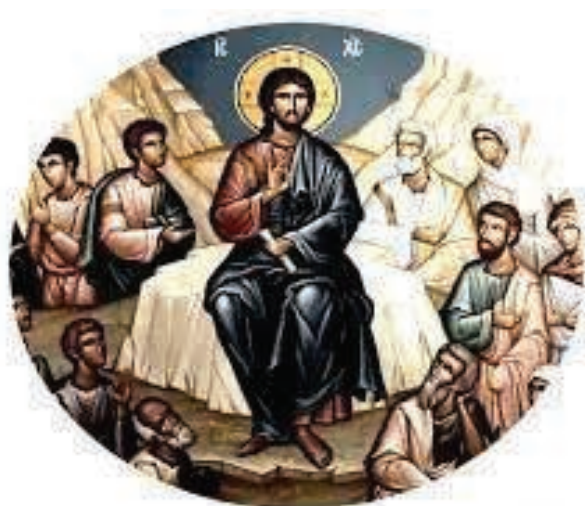
The Eight Beatitudes

www.HelpOurMarriage.org or call 215-766-3944 or 800-470-2230. All inquiries are strictly confidential.