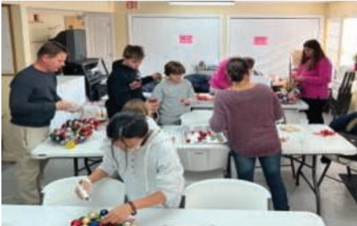
Making of Wreaths

Many heartfelt thanks go out to our Knights of Columbus and those who participated or volunteered to help with these events – sharing the Hope and Joy of this Advent season.