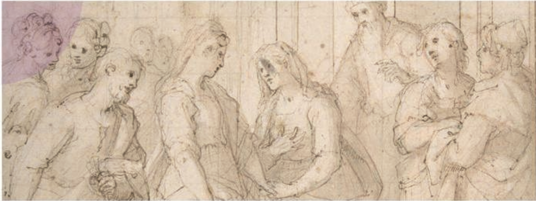
Giovanni Battista Tiepolo, The Visitation of the Virgin to Saint Elizabeth , the Met Museum

I n the Gospels this week, we hear about Mary visiting her kinswoman Elizabeth. Elizabeth was much older than Mary and it was a miracle she had also conceived a baby. Elizabeth and her husband Zechariah were parents of John the Baptist. Unlike Mary, Zechariah did not believe when an angel revealed to him that his wife would bear a son and name him John. When he doesn't believe the angel, he is struck dumb until he confirms the name John at his son's circumcision. Elizabeth is the patron saint of pregnant women and infertile couples.