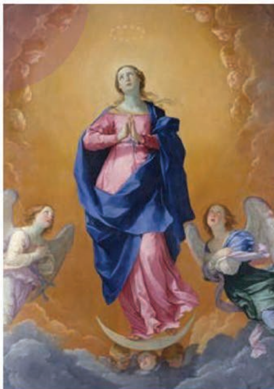
The Immaculate Conception, 1627, Artist: Guido Reni Italian, Met Museum Collection.