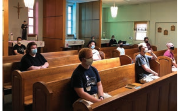
Seminarians from the Diocese gather for an annual retreat in San Alfonso Retreat House, West End.