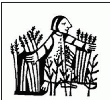
First collect the weeds and tie them in bundles for burning; but gather the wheat into my barn. Matthew 13:30

Catholic Charities in Manchester also provides a metal bin for clothing. They are located at 88 Schoolhouse Rd, Manchester Township, NJ 08759.